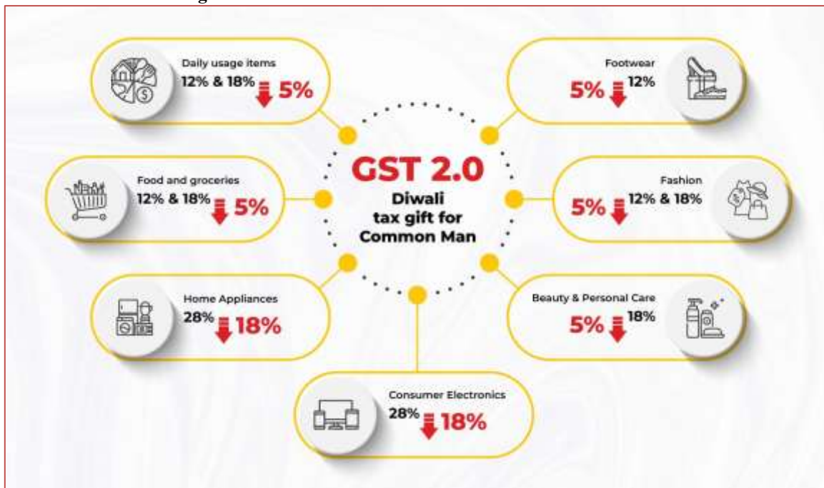
GST 2.0: A New Era of Simplified Tax and Growth for Retailers