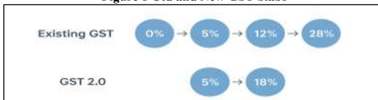
Figure 1 Old and New GST Slabs

The GST 2.0 initiative replaces twelve earlier slabs with a simplified three-tier structure—5%, 18%, and 40%. Nearly 83 essential items of daily use, including food, healthcare, and education materials, have seen tax reductions or exemptions. This consolidation enhances transparency, reduces classification disputes, and improves business ease.