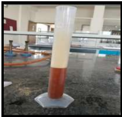
Fig.7. Foaming index

It is determined by taking 10ml of 1%w/v dispersion of handwash powder in 100ml measuring cylinder. The dispersion is stirred mechanically for 30 minutes for creating the foams. When the maximum foams are produced, the volume occupied by the foams is recorded and the mean of the three respective observations is recorded. Result calculated by measuring the height of foam developed in the measuring cylinder.