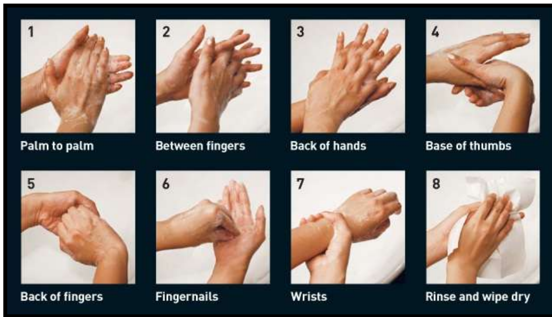
Fig.1. Steps of hand washing