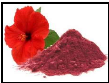
Fig.3. Hibiscus flower