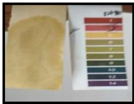
Fig.6. Determination of pH

A 1%w/v dispersion of handwash powder is prepared in distilled water and shaken gently for 30 minutes for homogenous dispersion. The dispersion is filtered through Whatman filter paper at room temperature and the pH of the filtrate is measured by digital pH meter. The measurement of sample is performed in triplicate and the results is expressed as the mean of measured observations. The acceptable pH between 5.5-10.5.