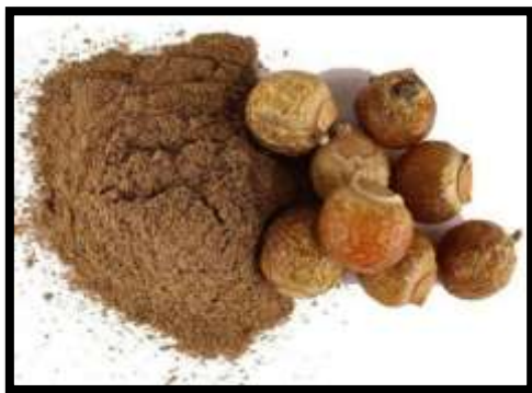
Fig. 2. Reetha

Synonym :- Sapindus mukorossi, Haithaguti, Ritha, Aritha,