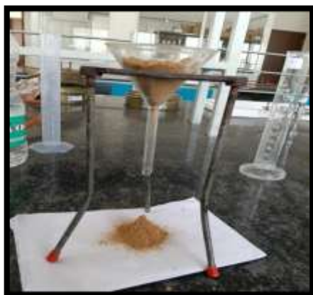
Fig.8. Angle of repose

It is determined by heap method. Briefly the powder is poured through a glass funnel from a definite distance to the smooth horizontal surface until a heap of maximum height is formed in a conical form. The diameter and the height of the heap is determined, and the tangent of the angle is determined by following expression