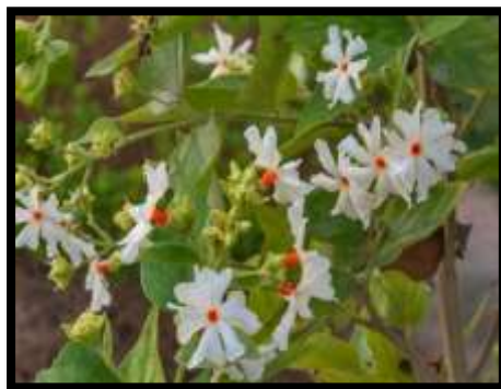
Fig.5. Cestrum Nocturnum