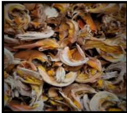
Fig.4. Butea Monosperma

Synonym: - Palash, Dhak, Flame of the forest