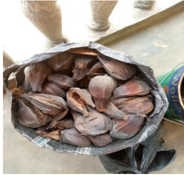
Plate 2: Dried Nypa frutican