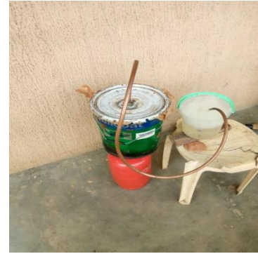
Plate 3: Carbonization of Nypa frutican