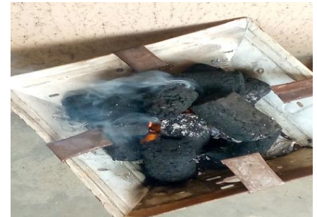
Plate 6: Burning of briquetted Nypa frutican