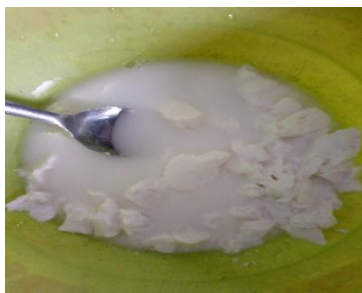
Plate 4: Manihot esculenta starch used as binder