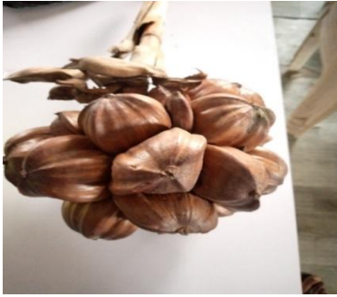
Plate 1: Freshly Harvested Nypa frutican