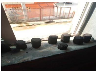
Plate 5: Briquetted Nypa frutican