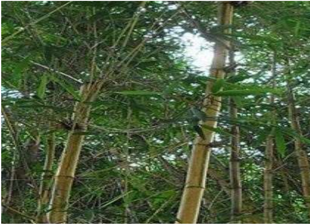
Picture: Bamboo Plant